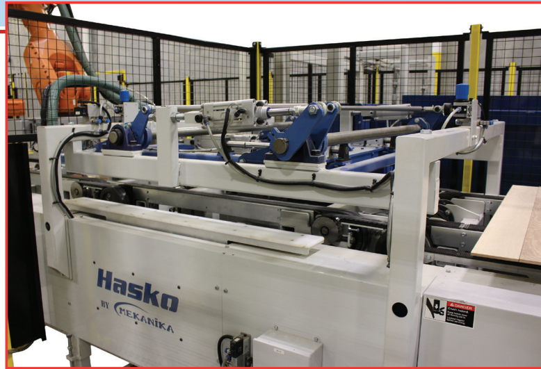
HASKO Material Handling System

Key products in the complete line of wood manufacturing machinery by HASKO