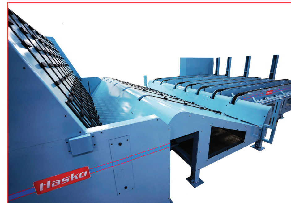
HASKO Package Breakdown and Unscrambler

Package Decks, Package Breakdown and Unscramblers for: