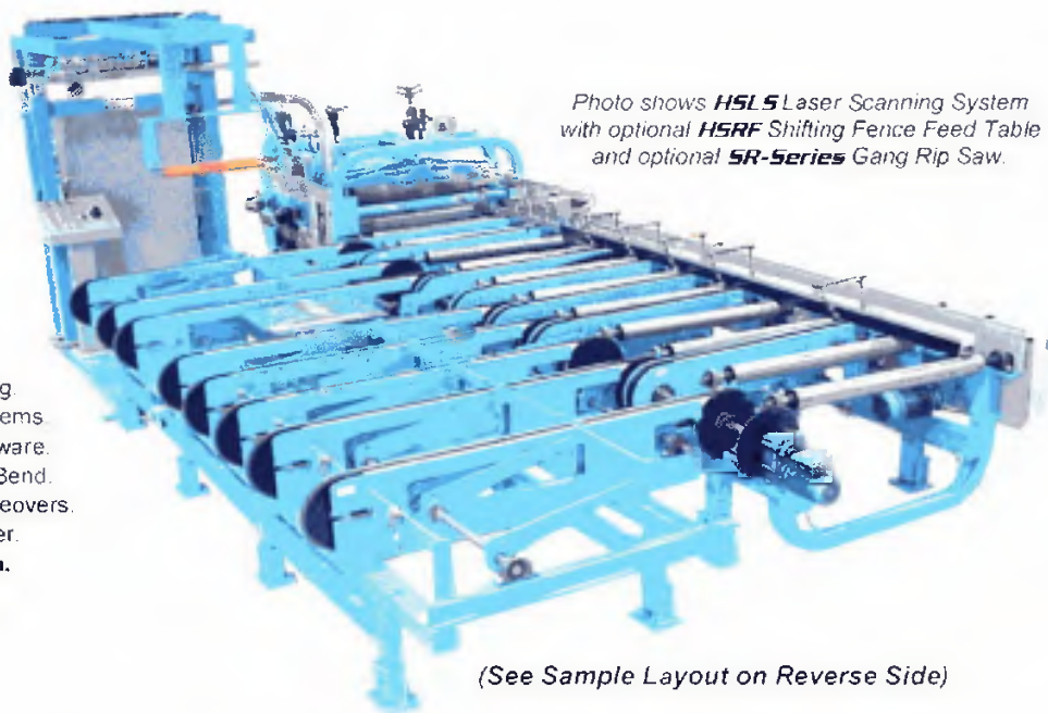
Photo shows HSL5 Laser Scanning System with optional HSRF Shifting Fence Feed Table and optional SR-Series Gang Rip Saw.