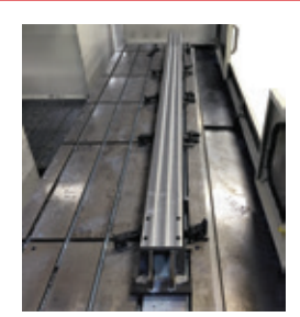
Complex medium-sized work pieces produced on a Haas CNC Vertical Machining Center (150" x 50") x 50")