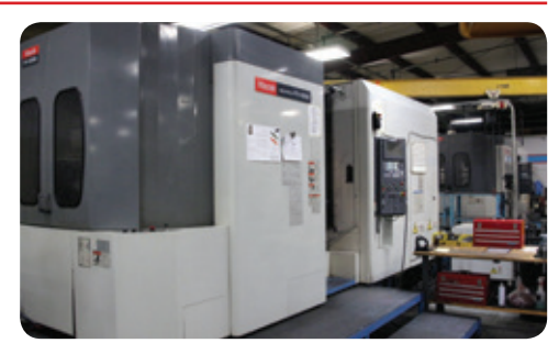
Mazak CNC Horizontal Machining Centers with Pallet Changers

(60" between centers, 4.4" through spindle, 12" chuck)