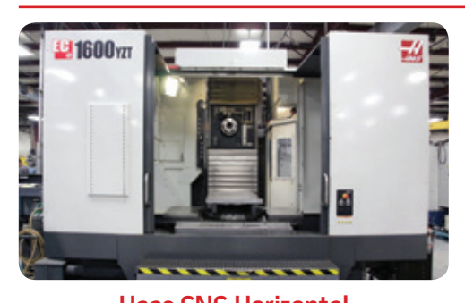
Haas CNC Horizontal Machining Center

(64" x 50" x 40") with 4<sup>th</sup> axis rotary turntable built in