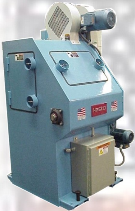
Built-In Controls and Access Panels