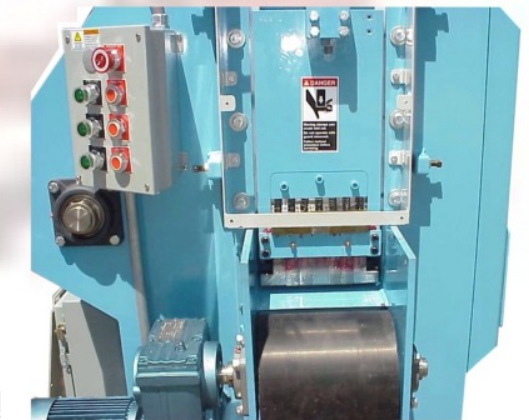
Clamping Mechanism (Guards Removed)